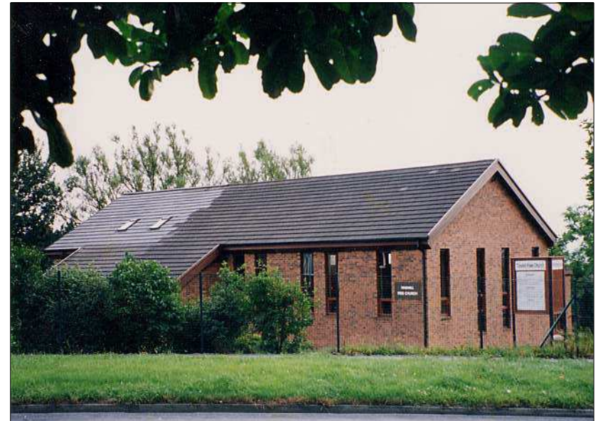
TINSHILL FREE CHURCH